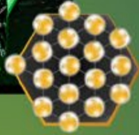
NANO HYBRID POLYMER