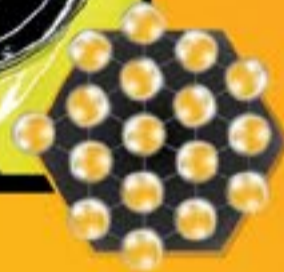
NANO HYBRID POLYMER